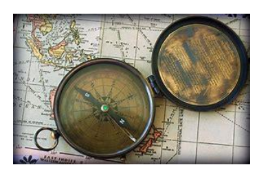
Travel Lunch Bunch

As United Methodist Church members we have vowed to support Tulare UMC with our prayers, our presence, our gifts, our service and our witness.